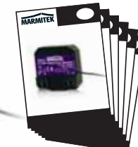
1x User Manual English, Deutsch Français, Espanol, Italiano, Nederlands