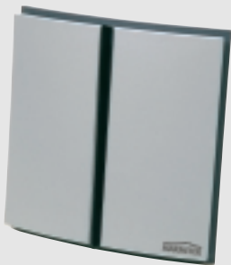
IR455 B&amp;O to X-10 Converter