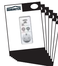
1x User Manual English, Deutsch Français, Español, Italiano, Nederlands