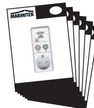
1x User Manual English, Deutsch Français, Español, Italiano, Nederlands