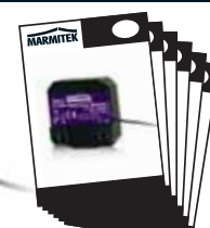
1x User Manual English, Deutsch Français, Espanol, Italiano, Nederlands