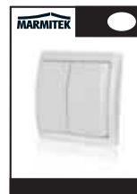
1x Quick Start Guide (EN) Full Instructions in 6 languages available online. (EN DE FR ES IT NL)