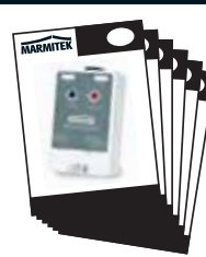
1x User Manual English, Deutsch Français, Español, Italiano, Nederlands