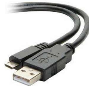
Type A to Micro-B cable (2444B5)