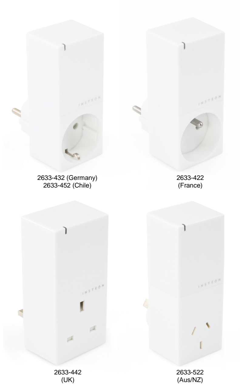
2633-432 (Germany) 2633-452 (Chile)